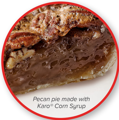
Pecan pie made with Karo ® Corn Syrup