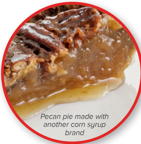
Pecan pie made with another corn syrup brand